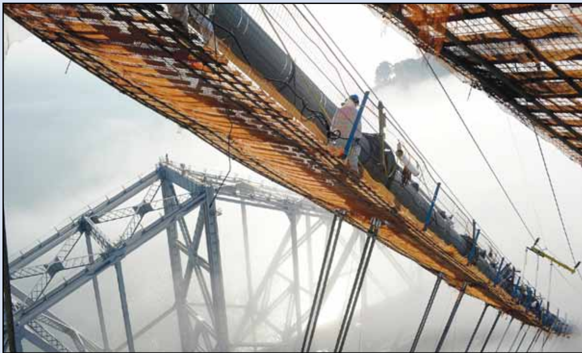
Laborers carrying cans of Grikote anti-corrosion paste on the south-side span south catwalk in the fog, 2012.