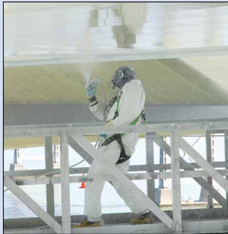
A member of Painters is seen painting the skyway, 2007.